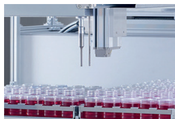
sample tube and ultrasonic probe

The integrated sample preparation via ultrasound ensures a dissolution of particle agglomerates and a mixing of the sample immediately before the measurement. This stage of the sample preparation also assists in removing aeration from the sample. During the measurement of one sample the subsequent sample is being prepared, reducing overall operational time. The sampling tube and ultrasonic probe are cleaned automatically after each operational step to prevent cross-contamination. This is achieved by returning the sample tube and ultrasonic probe to the pre-filtered cleaning fluid reservoir.